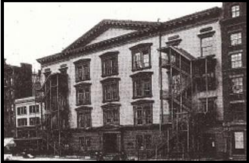
1865 Building P.S. 47 School for the Deaf

In 1906, New York boasted of having three schools for the Deaf. All were residential and all required payment. However, a group of parents wanted their children to return home daily and these parents protested at City Hall, braving a storm. They pled with Mayor George Brinton McCelan to form a public day school for Deaf students. The Board of Education assigned two educators to study this concept, and then approved money for the renovation and repair of a warehouse at 225 East 23 rd Street.